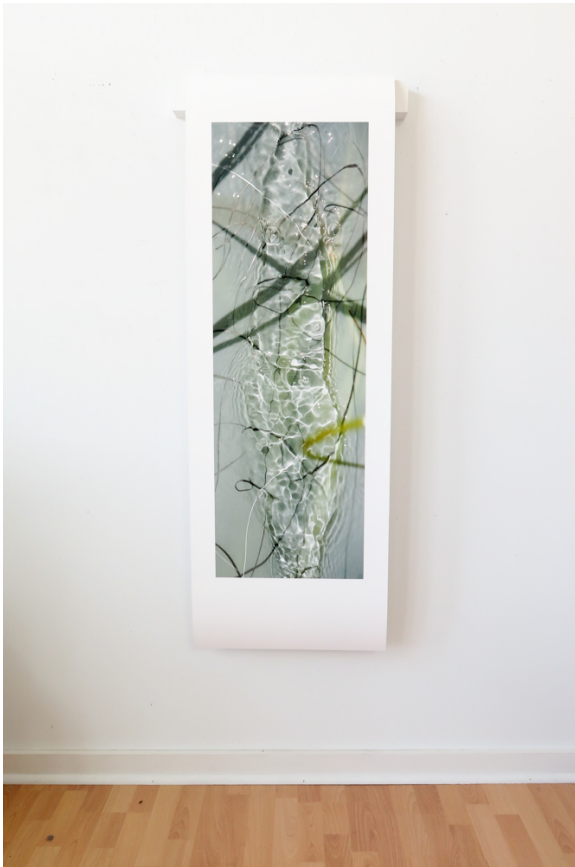
Surface Notes I , 2014