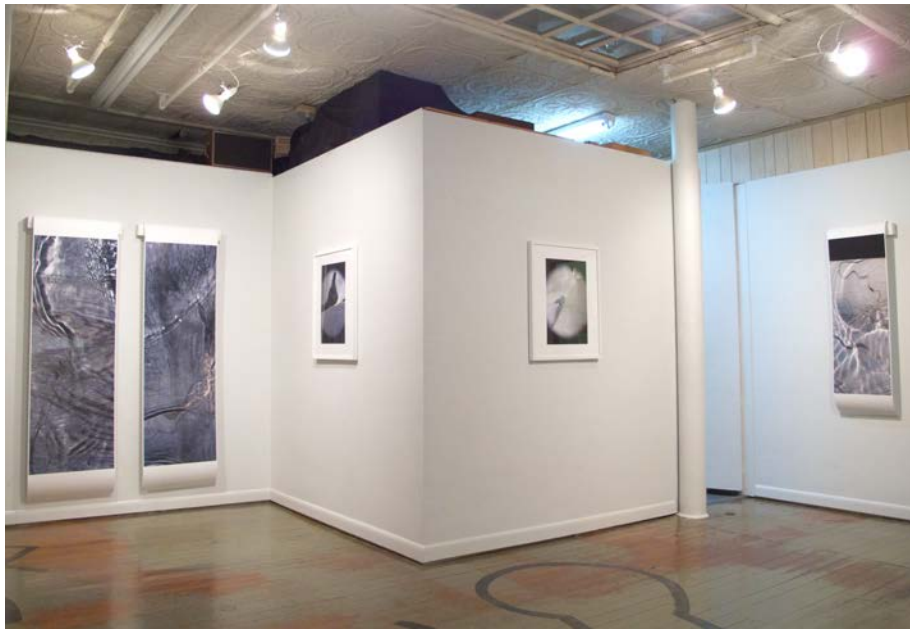
Installation View of Lalim III & IV , Dark Noon XIII & XIV , and Light Spills