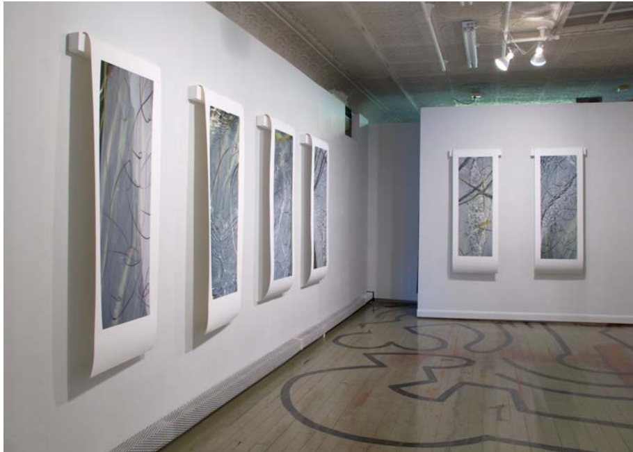
Installation View of Surface Notes I-VI