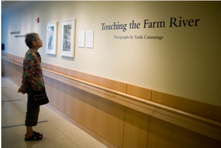
Installation View of Maria Tupper at Exhibition