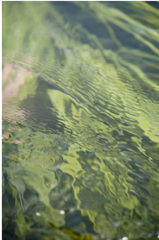
Within Reach, 2014