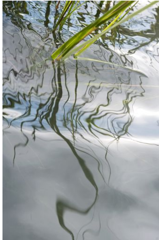
Linear Veil III, 2012

Healing Arts Gallery | Smilow Cancer Hospital at Yale - New Haven 20 York Street | New Haven, CT | 06510