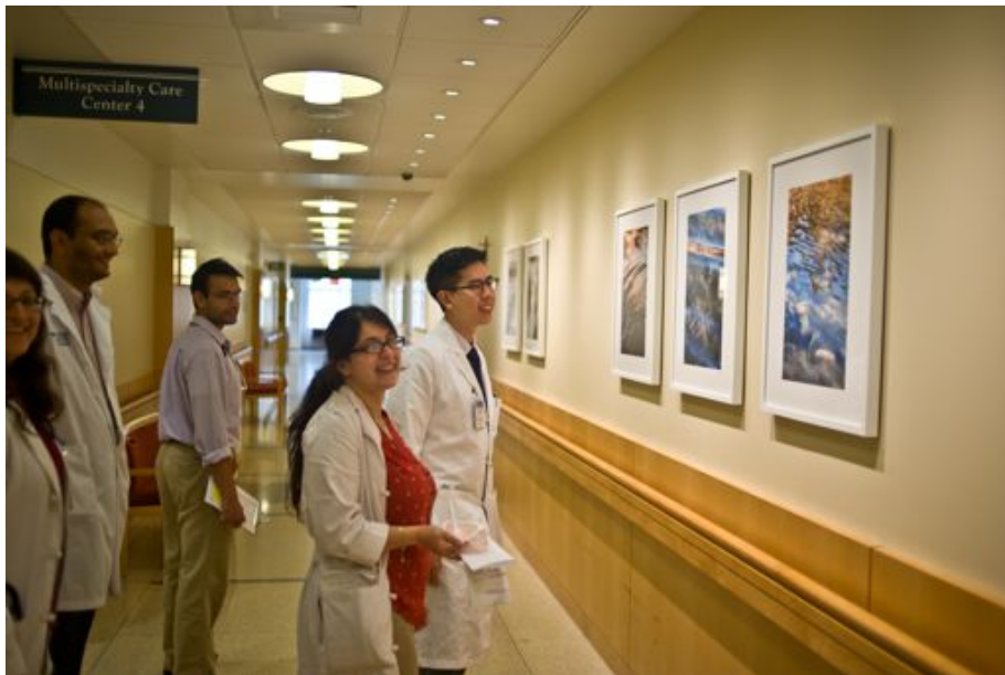
Installation View of Residents at Exhibition